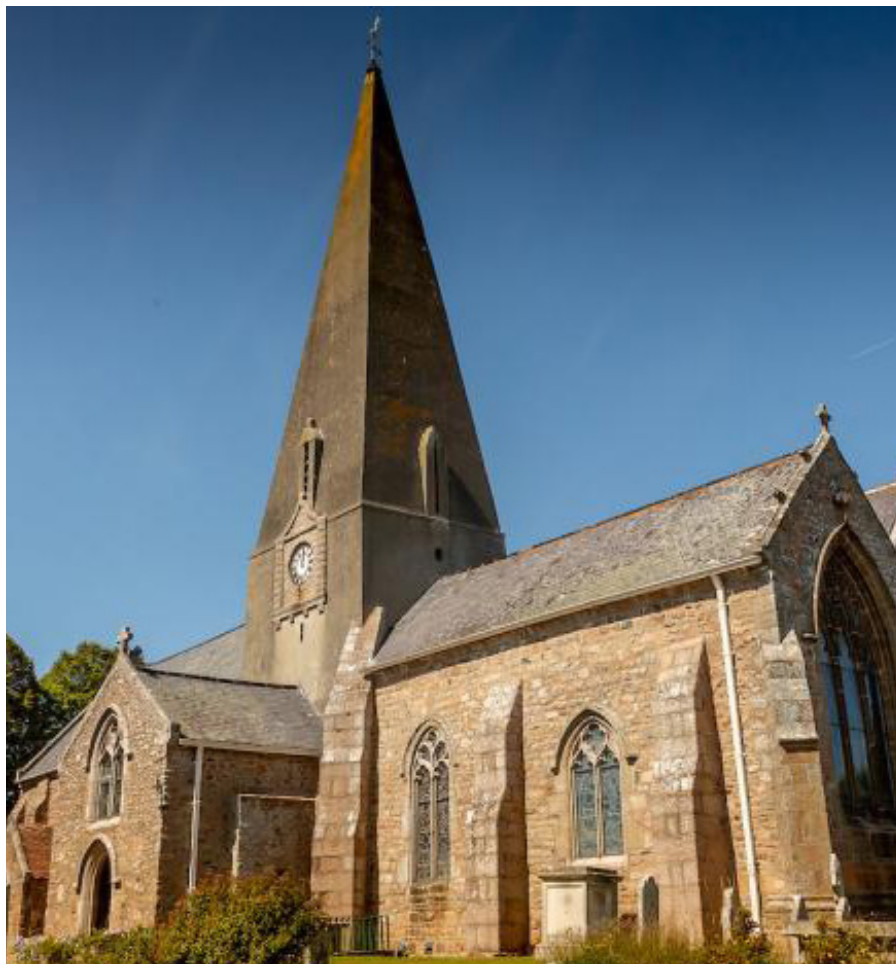
■ St Clement's Church

The trackway now begins to slope downhill with high banks either side and views to the west of the horse paddock and grazing field passed at the beginning of the walk. There is a wide range of plant species along here as tractors very infrequently use this section of track and as a result it is rich in insect life. This track joins onto Rue Graut so turn left at that junction to retrace your steps taking care when emerging onto the main road.